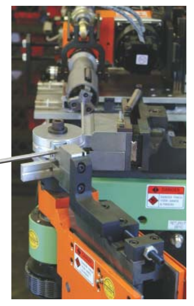
Shown above is one of the new, high precision, bending machines currently in operation at Eagle.