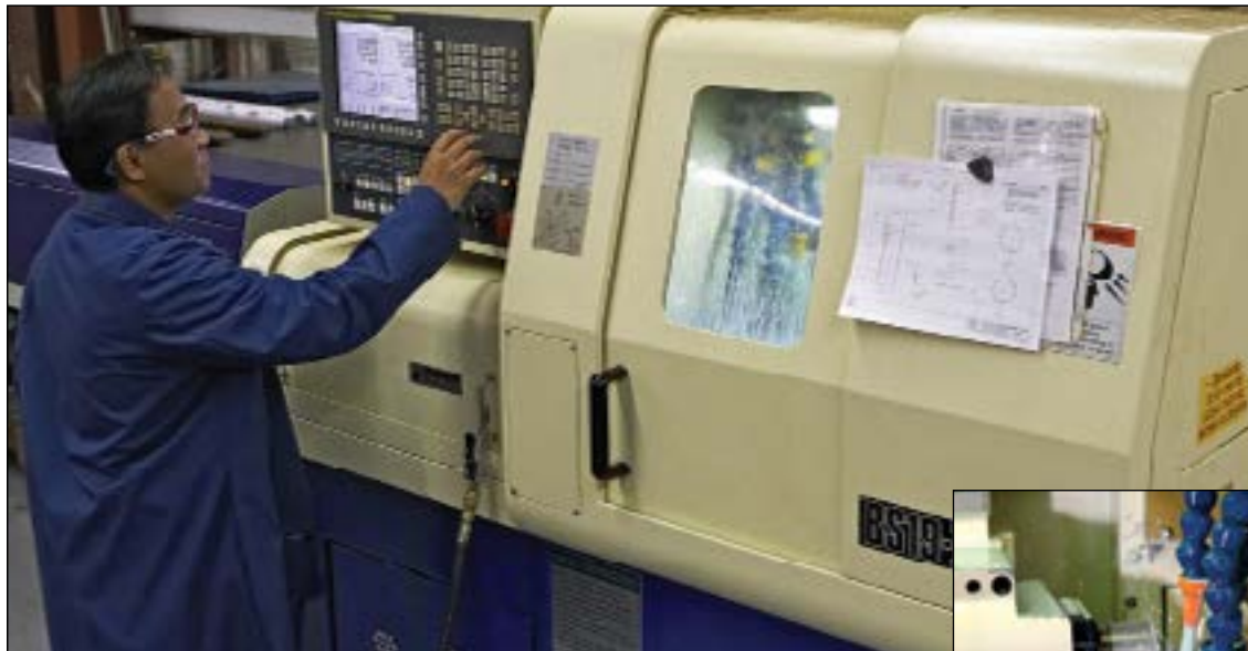
CNC machining centers assure repeatable precision in all Eagle Stainless products

Closed End Tubes - Closed end tubes are spun closed and welded shut in various end configurations: round, flat or pointed. All tubes are tested to insure there is no porosity or leakage.