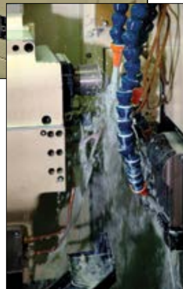
Precision-machined parts fresh from a cutting oil bath in one of the Eagle CNC machining centers.