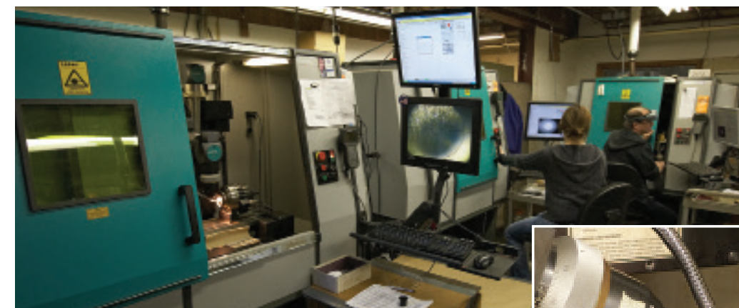
Computer controlled laser machining equipment enables extremely close-tolerance cutting, notching, etching and welding operations. Some assemblies require both laser welding and soldering as shown in the typical drawing below.

Welding & Brazing - Welding, brazing or soldering of standard or custom-made components to customer drawings or specifications are performed on state-of-the-art equipment including computer-controlled, laser machining centers as shown below.