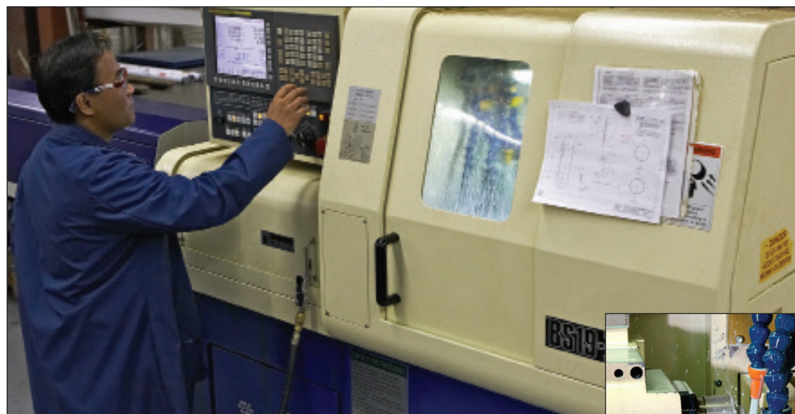
CNC machining centers assure repeatable precision in all Eagle Stainless products