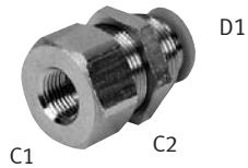
Push-in Bulkhead Fitting, with Female NPT Thread