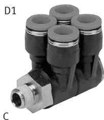
Push-in Elbow Double Y Fitting, NPT