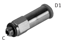
Push-in Straight Fitting, UNF, with Internal Shut-off