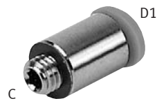
Push-in Straight Fitting, UNF, with Internal Hex