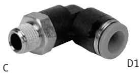
Push-in Elbow Fitting, NPT