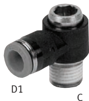
Push-in Elbow Fitting, NPT, with Internal Hex