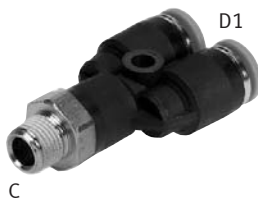
Push-in Y Fitting, NPT