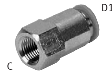
Push-in Straight Fitting, NPT, with Female Thread