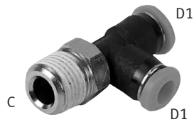
Push-in Branch T Fitting, NPT