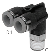
Push-in Elbow Y Fitting, NPT