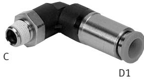
Push-in Elbow Fitting, NPT, with Internal Shut-off