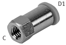
Push-in Straight Fitting, UNF, with Female Thread