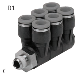
Push-in Elbow Triple Y Fitting, NPT