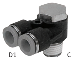
Push-in Elbow Y Fitting, NPT, with External Hex