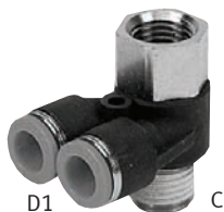
Push-in Elbow Y Fitting, NPT, with Male and Female Thread