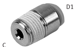
Push-in Straight Fitting, NPT, with Internal Hex