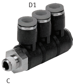
Push-in Triple Elbow Fitting, NPT