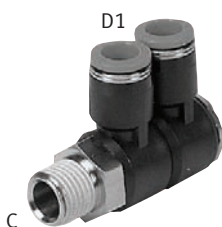
Push-in Double Elbow Fitting, NPT