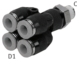
Push-in Double Y Fitting, NPT