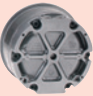
Back view for surface mounting.