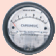
Flush mounted in panel.

Capsuhelic® gages may be flush mounted in a panel or surface mounted. Hardware is included for either. For flush mounting, a 4.13" diameter cutout in panel is required. Where high shock or vibration are problems, order optional A-496 Heavy Duty flush mount bracket. Optional A-610 kit provides simple means of attaching gage to 1/4"-2" horizontal or vertical pipe. Installation is same as Magnehelic® gage shown on page 5. All standard models are calibrated for vertical mounting. Gages with ranges above 5 in. w.c. can be factory calibrated for horizontal or inclined mounting on special order.