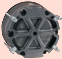
Back view shows flush mounting adapters.