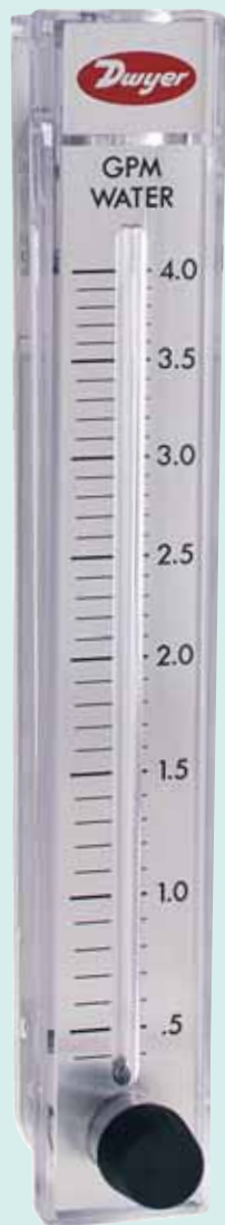
Model RMC-SSV 10" scale, 15-3/8" high