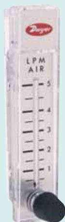
Model RMA-SSV 2" scale, 4-13/16" high