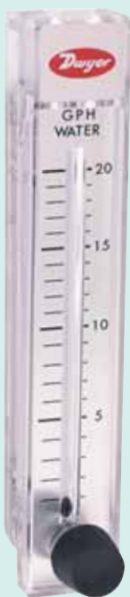
Model RMB-SSV 5" scale, 8-3/4" high