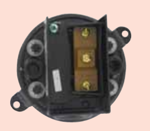
Series 1910 pressure switch with new black cationic epoxy coat plated housing.