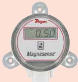
Standard MS with optional LCD