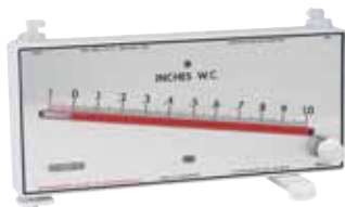
MARK II MODEL 40