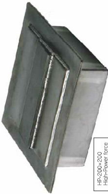
HP-200x200 High-power force