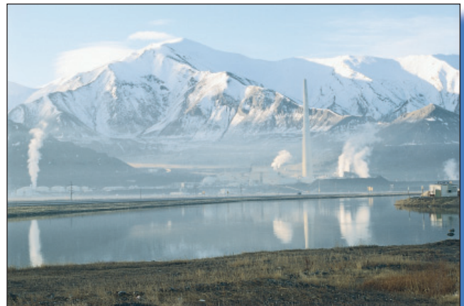
The CR3000 can be used in networks of dataloggers that continuously monitor air quality.