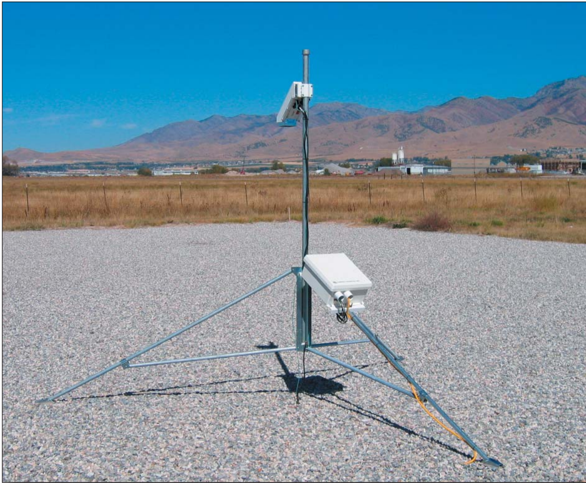
The CS110 is designed for easy attachment to a tripod or tower (shown attached to a CM10 10 ft steel tripod).

The CR1000's onboard programming language, CRBasic, provides data processing and analysis routines that support user control over sample (measurement) rates and setting of alarm conditions. LoggerNet Datalogger Support Software facilitates programming, communications, and data retrieval between the CS110 and a PC.