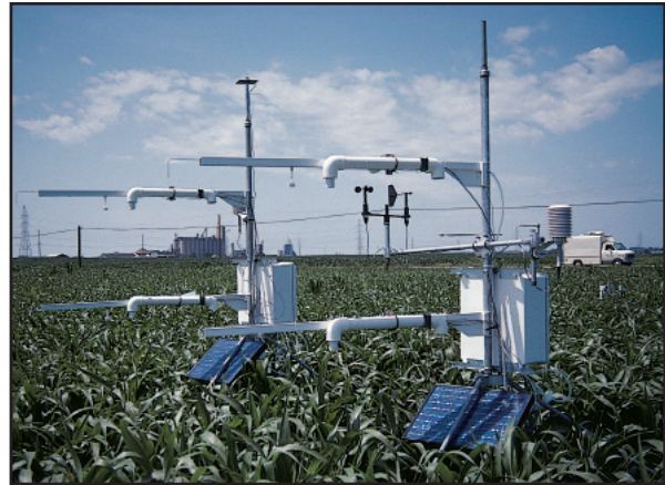
These Bowen ratio systems at a sorghum field near Lincoln, Nebraska include ASPTCs attached to the upper and lower Bowen ratio arms.

The aspirated radiation shield consists of an elongated tube constructed from white UV stabilized polyethylene that provides low thermal conductivity and heat retention. A fan draws air across the measurement junction, which reduces solar loading on the thermocouple. The radiation shield also protects the thermocouple, increasing the thermocouple's durability.