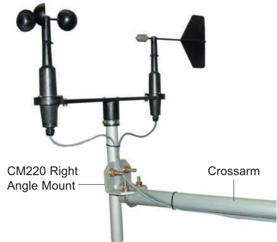
The 03001 is secured to one end of the CM206 Crossarm with the CM220 Right Angle Bracket.