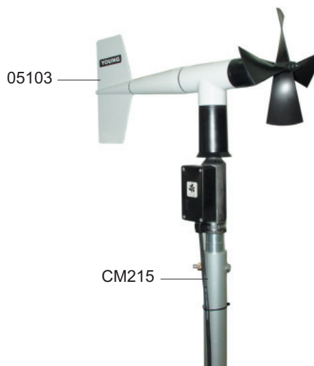
The CM215 allows the Wind Monitor to sit atop an aluminum tripod.

The LLAC4 is often used to measure up to four Wind Monitors, and is especially useful for wind profiling applications.