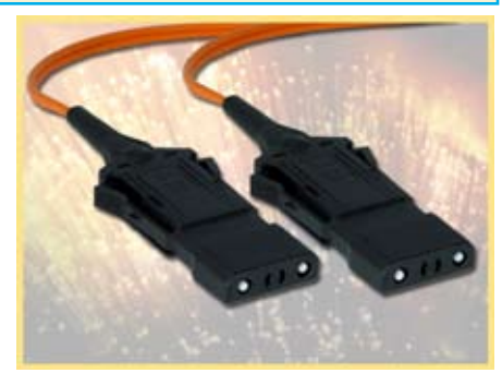
ESCON-ESCON FIBER OPTIC DUPLEX CABLE