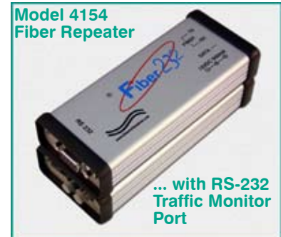
Fiber 232® HP Fiber Repeater with RS-232 Traffic Monitor Port

The HP Fiber Repeater with RS-232 Monitor Port is used to regenerate data signals in order to extend the range between optically linked data terminals. It also has the capability to monitor network traffic via an RS232 Monitor Port. The fiber optic communication standard also allows data transmission that is no longer susceptible to electrostatic or electromagnetic fields. Additionally, the RS-232 monitor port is protected from damage by potential differences (ground variations) that often exist between them.