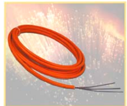
36-Fiber Crush Resistant cable utilized in trunk cables (three 12-fiber ribbons).