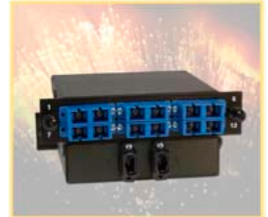
Model 6006 One 12-Fiber MTP/MPO input break-out to 12 SC outputs. (12 Simplex or 6 Duplex)