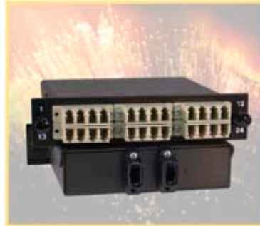
Model 6012 Two 12-Fiber MTP/MPO inputs break-out to 24 LC outputs. (24 Simplex or 12 Duplex)