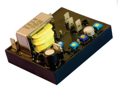
SSR Proportional Control EA Series Case: 3.2" x 2.6"