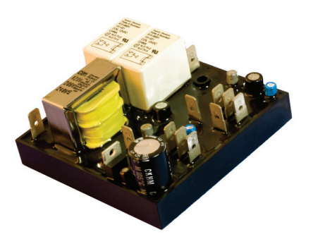
Dual Zone ON/OFF Control BA Series Case: 3.5" x 3.5"