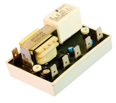
15A Relay ON/OFF Control AA Series Case: 3.2" x 2.3"

Thermalogic specializes in efficient delivery of built to order controls. Our custom build philosophy offers solutions that are not readily available with many off-the-shelf products. Thermalogic can work from your drawings, sketches, descriptions, ideas or obsolete units to meet your exact control needs. Below is a representation of an almost infinite array of our custom controls. The specifications listed below are just a small sample of what is available. CUSTOM SPECIFICATIONS DO NOT MEAN LONG DELAYS .