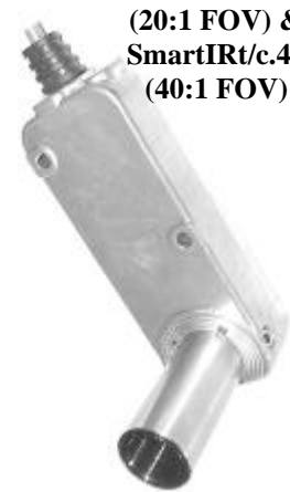
SmartIRt/c.20 (20:1 FOV) & SmartIRt/c.40 (40:1 FOV)

3.71" x 1.37" x 0.76" (94.3 x 34.9 x 19.4 mm)