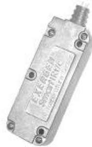
SmartIRt/c.3 (3:1 FOV) & SmartIRt/c.5 (5:1 FOV)

3.71" x 1.37" x 0.76" (94.3 x 34.9 x 19.4 mm)