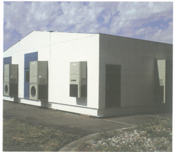
Power Distribution Center, complete