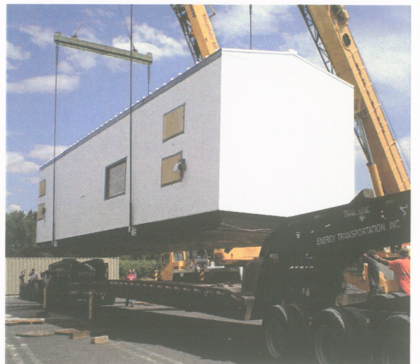
MCC Shelter- Dubai, UAE