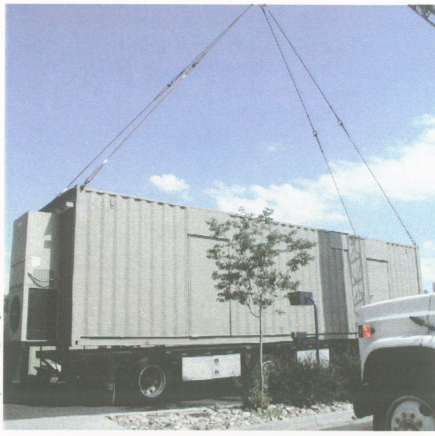
Modified Conex Container (right)