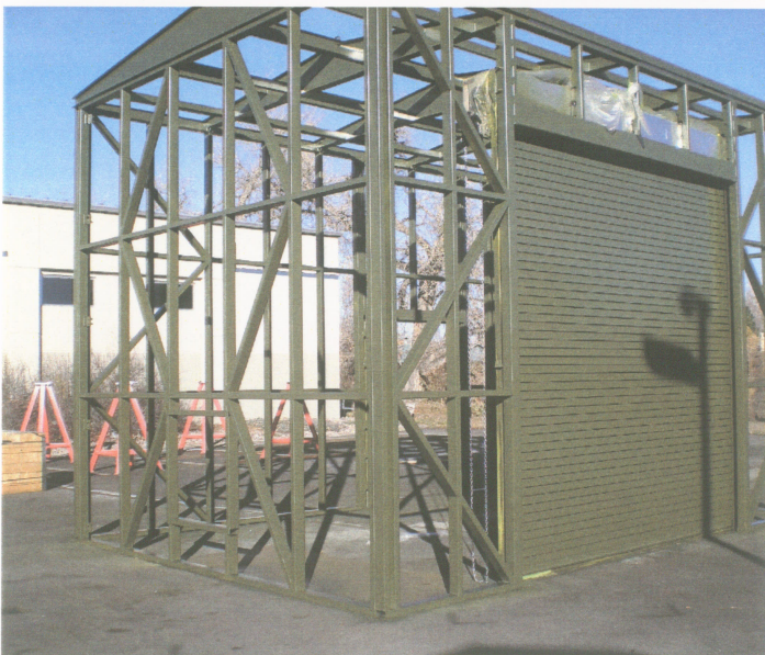
Power Distribution Center, beginning phase