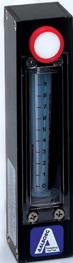
Low Range PTFE meter without Valve