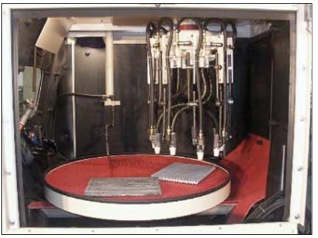
To process flat parts uniformly, a horizontal oscillator extends the reach of the rotary head shown above. With the addition of the oscillator, the single six-gun head provides even blast coverage and consistent finishing results from the center to the circumference of the system's 48" powered turntable.