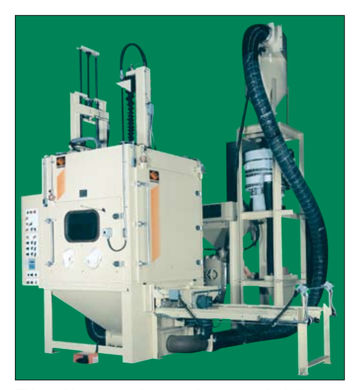
This multi-purpose shot-peening system includes an ID blast lance to peen recessed surfaces on parts, a powered loading cart, independently adjustable pressure nozzles, a shot classifier, and a combination of vertical/horizontal oscillating blast nozzles. Operating parameters are adjustable, making this machine ideal for job-shop work.