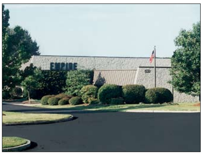
Empire Abrasive Equipment Company, headquartered in Langhorne, Pennsylvania, specializes in the development of air-blast systems and equipment.

Empire has the experience, innovative engineering, test facilities and production capabilities to automate almost any air-blast process at a price that will produce a very attractive return on your investment.