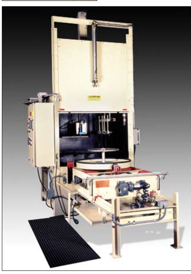
Versatile peening machine enabled a repair center for jet-engine parts to expand its business into the areas of disc and hub rebuilds. In addition to peening recessed surfaces, the unit processes many different size parts ranging up to thirty inches in diameter.

Interface terminal enables operator to designate blasting parameters such as nozzle stroke length and oscillation speeds, ON/OFF status of selected nozzles, part rotation speeds, and blast duration by simply inputting the appropriate part identification number.