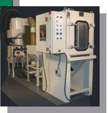
Cell Machines Page 8