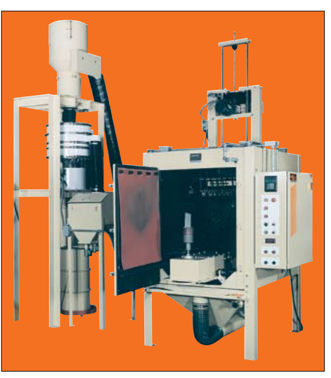
Glass-bead system for peening jet-engine turbine blades incorporates vertically oscillating nozzles, a vibratory bead classifier, and one rotating work station.