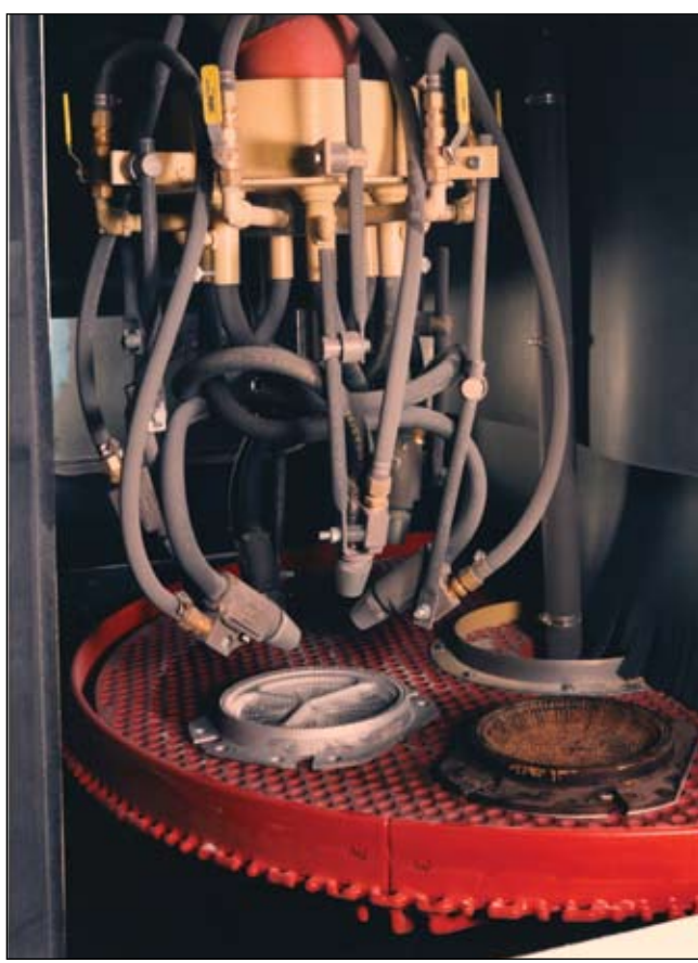
Adjustable blast-head clearance and nozzle angles, combined with variable head and turntable speeds, not only make Empire rotary-head machines versatile; they also assure precise control of cleaning and finishing processes.

Empire's rotary blast head delivers tremendous coverage while conserving compressed air. When the application calls for it, our rotary head will outperform any horizontal-nozzle oscillator, including our own, by reducing the number of blast guns and energy required for the job. Our rotary heads contribute to the outstanding performance of our in-line conveyor, continuous turntable and batch turntable machines.