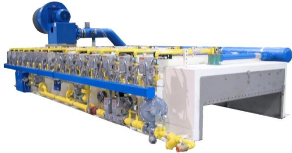
Scrap Preheaters/ Dryers

Stelter & Brinck, Ltd. scrap preheaters dry and preheat simultaneously. These units are designed to fit on top of material conveyors designed for use with a preheater. These units are completely self contained and feature high turn down, high velocity burner systems to provide high air flow rates for drying and high energy to drive the heat into the load. Stelter & Brinck scrap preheaters provide increased throughput by supplying a hot charge for melting.