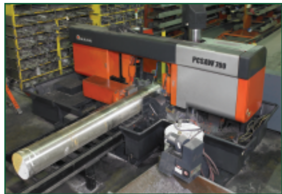
Amada large-diameter bar cutting