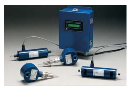
Accurate, repeatable measurement of liquid flows as low as one gallon per year (10cc per day), and gas flows down to 20 sccm.